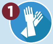
1 Remove Gloves

PPE must be removed slowly and carefully and in the correct sequence to avoid self-and cross-contamination of the workplace.