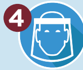
4 Remove Full Face Shield