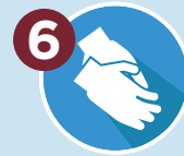
6 Perform Hand Hygiene