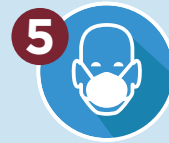
5 Remove N95 Respirator