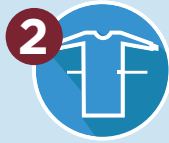
2 Remove Gown