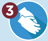
3 Perform Hand Hygiene