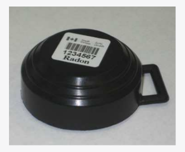
Alternately a Radon Measurement and/or a Mitigation Specialist can provide these services.

Various types of Passive Radon Dosimeters can be used over a time period from 3 days to as much as one year to sample the indoor condition. A photo of one type of radon dosimeter is shown below.